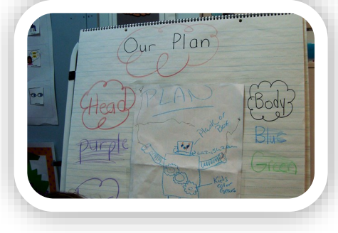
Dix Hills CLASSROOM 103 Honorable Mention