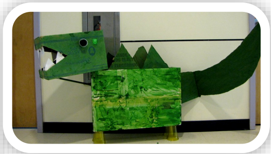
East Setauket CLASSROOM 20 Honorable Mention